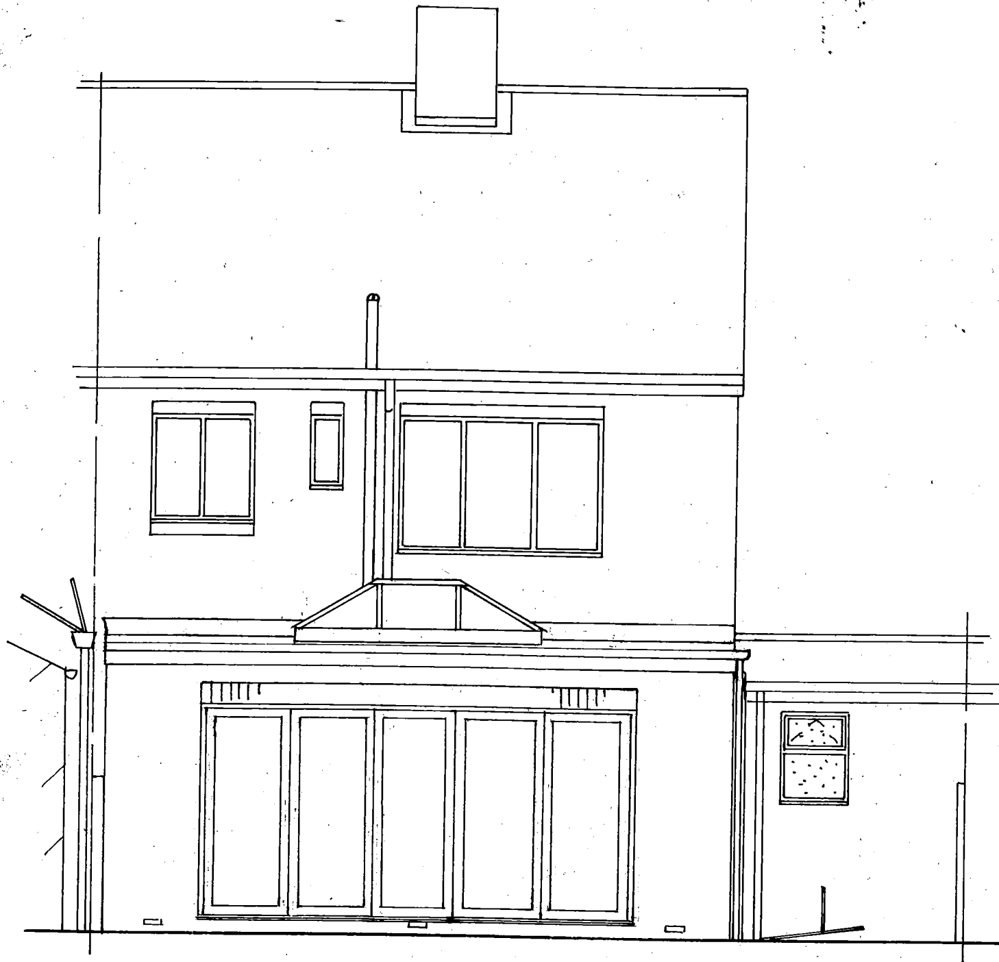
PROPOSED REAR 1:50

ROOF TILE, FACING BRICK, ETC. TO MATCH EXISTING AS CLOSELY AS POSSIBLE. DARK GREY DOOR/WINDOW FRAMING.